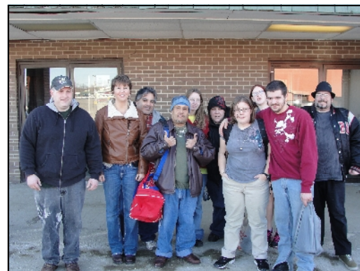
High Hopes attends the Gym

Members and staff are also encouraged to use the gym in the evenings and weekends. Thank you Inland Hospital.