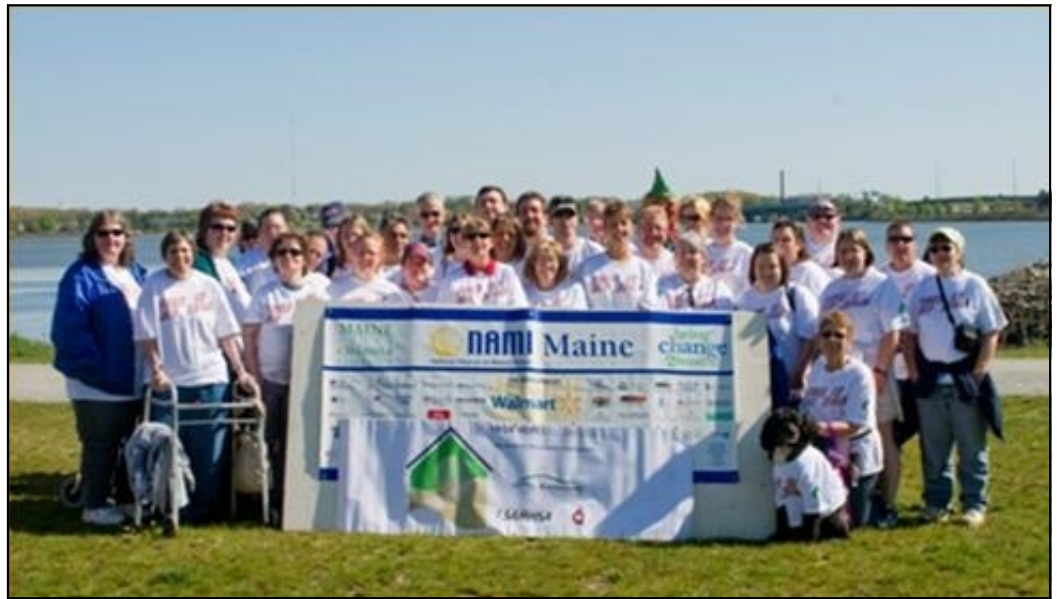
The High Hopes Team at the NAMI Walk in Portland, Maine

On May 12th, 2012 around 40 members and staff participated in the annual NAMI (National Alliance on Mental Illness) walk that took place in Portland, Maine around Back Bay. We raised close to $4,000! A few members and a staff from our team were some of the first to cross the finish line. The weather was gorgeous. Congratulations to all who went down!