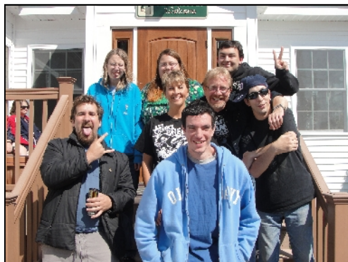
YAC going to the hard rock concert